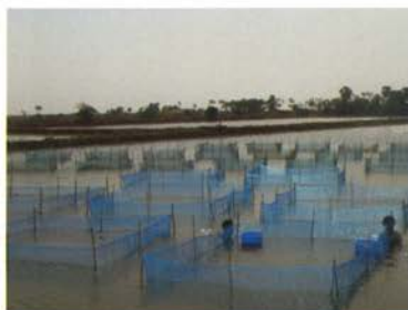
Cage rearing of sea bass seed in a farmers pond

NFDB in association with Central Institute of Brackishwater Aquaculture (CIBA), Chennai is demonstrating the techno economic viability of Asian Seabass, Lates calcarifer farming in a farmer's ponds in Maharashtra, Andhra Pradesh and Tamil Nadu by using the indigenous low cost feed. Rs. 54.00 lakhs was released to undertake this demonstration in farmer's ponds. There is good progress in implementing the project and results are encouraging.