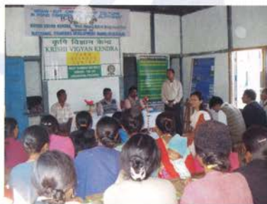
Training programme on Grow-out of Chinese Carp Culture organised by KVK, Dirang (Arunachal Pradesh)