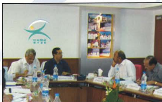
Revision of guidelines meeting in NFDB Hyderabad Meeting at MEPDA