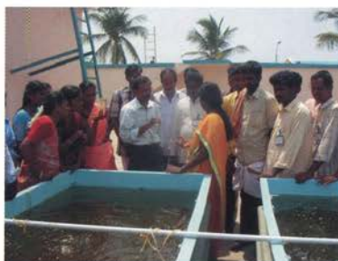
Training programme organised by KVK, Kattupakkam (Tamilnadu)