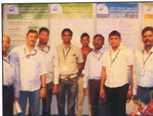
INDAQUA-2009 organized by MPEDA, Cochin from 21-23 th January 2009