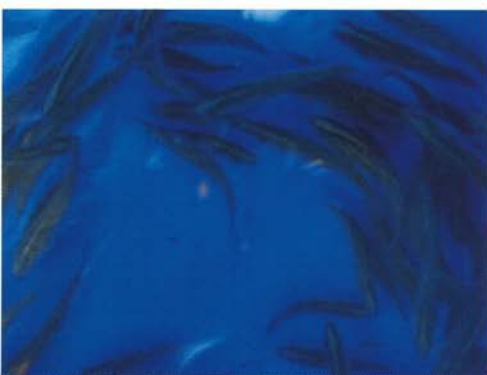
Sea bass juveniles