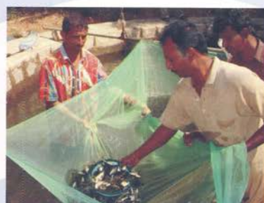
Reservoir stocking in Tami Nadu