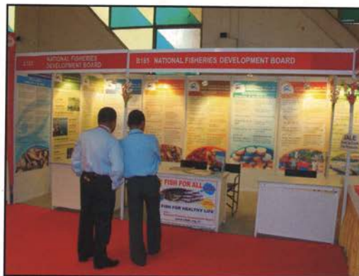
NFDB's stall in the The International Livestock & Dairy Expo [ILDEX]- 2008, 22-24 th August, 08 at Pragati Maidan, New Delhi