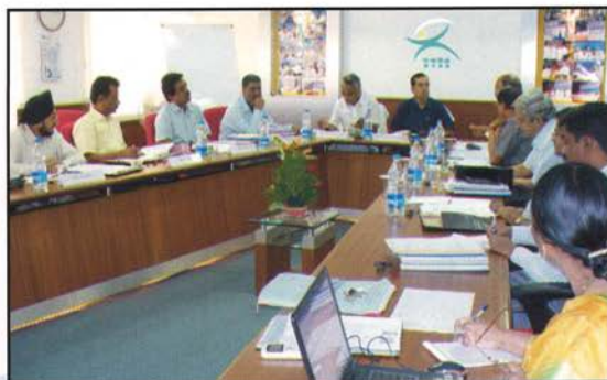
Revision of guidelines meeting in NFDB Hyderabad Meeting at MEPDA