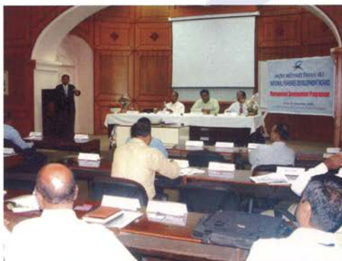
Training to Senior Officers of Department of Fisheries at ASCI, Hyderabad

In order to enhance the skills of the functionaries of State Fisheries Departments in project designing, project management and financial management, NFDB has provided financial assistance of Rs. 8.55 lakhs to Administrative Staff College of India (ASCI), Hyderabad towards the Training Needs Assessment (TNA) to identify the gaps in fisheries and development of fisheries. During the financial year one training programme was conducted and two more are proposed during 2009-10.