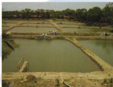
Sea bass culture pond