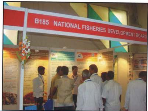
Participant of NFDB' in ILDEX Expo at Pragati Maidan, New Delhi