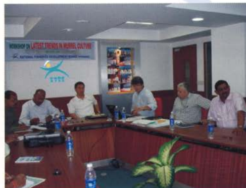
Strategic Planning Meeting on establishment of Multiplication Centre