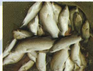
Sample of sea bass harvested from grow out pond