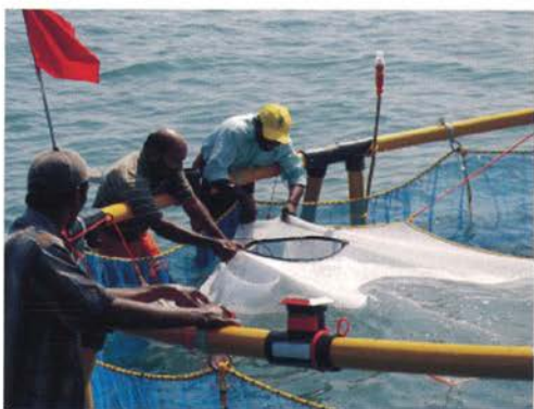
Stocking of Sea bass -Kochi