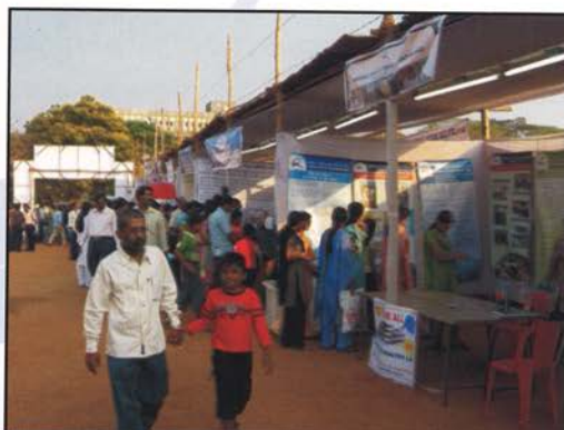
Mathsya Mela organized by College of Fisheries, Kankandy, Mangalore from 13-15 th February 2009