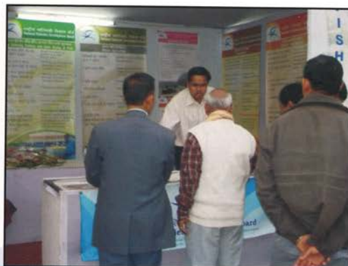
Fish Festival -2009 organized by Dept. of Fisheries, Govt. of Assam from 28-30 th January 2009