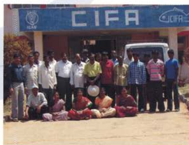
Training programme organised by CIFA, ICAR, Penisular Centre, Bangalore (Karnataka)