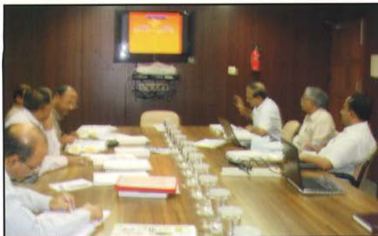
Revision of guidelines meeting in Cochin Meeting at MEPDA