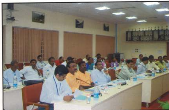
Workshop on Domestic Fish Marketing for the Fisheries Development Corporations and Federations at NAARM, Hyderabad, 29 th Sept., 2008