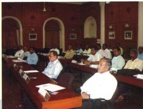
Training to Senior Officers of Department of Fisheries at ASCI, Hyderabad