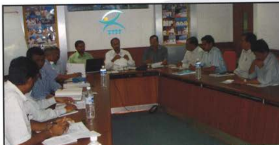
Consultative Meeting on Domestic Fish Marketing held with the Supermarkets and Retailers on 28.07.2008 at NFDB

This meeting was organized on 28.07.2008 with various stake holders involved in domestic marketing of fish and fishery products to discuss the prevailing problems in domestic marketing of fish and fishery products in the country. NFDB has initiated followup action in encouraging entrepreneurs to take up domestic marketing in Andhra Pradesh and other states.