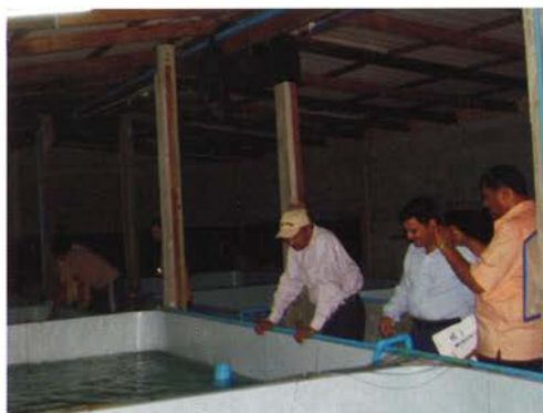
NFDB Delegation visited to M/s. Moana's SPF facility at Thailand