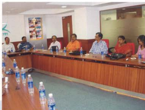
Senior Officers undergoing Training at MANAGE visited at NFDB during November, 2008