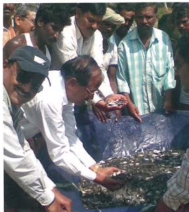
Reservoir Seed Stocking Programme by DOF, Karnataka