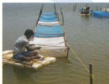
Demonstration of seabass seed rearing and culture at Nellore