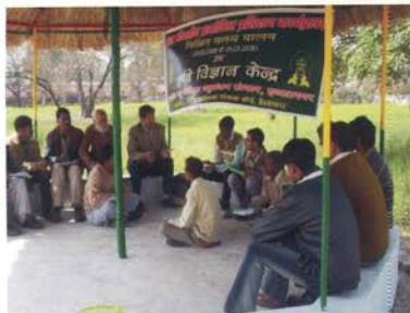
NFDB official interacting with the trainees at KVK, IVRI, Izatnagar, Bareilly (U.P.)