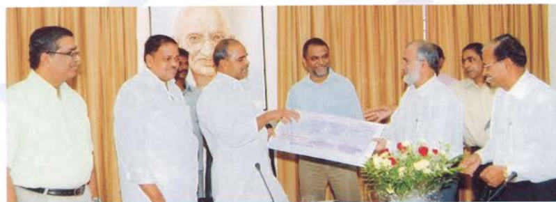
The Chief Executive i/c, NFDB handing over a cheque for Rs. 8.1252 Crores to the Honorable Chief Minister of Andhra Pradesh on 10.06.2008