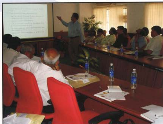
Brain Storming Workshop on Murrel Breeding and Culture on 6 th September, 08 at NFDB