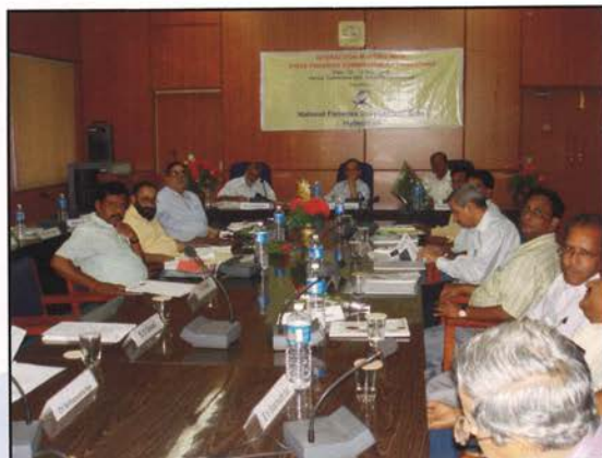
"Interaction meeting with the Director of Fisheries/Commissioners" chaired by the Joint Secretary (Fy), DAHD&F at NAARM, Hyderabad, 12-13 May, 2008