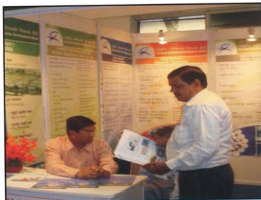
The India International Trade Fair [IITF] - 2008 organised by Ministry of Industries, Govt of India, from 14-27 th November, 08 at Pragati Medan, New Delhi