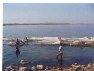
Cage culture at Essapur dam, Maharashtra