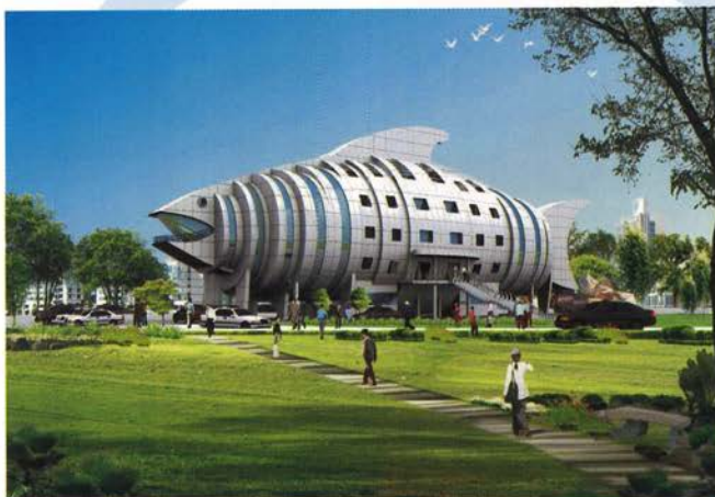
Proposed Administrative Building of NFDB

For establishment of the NFDB campus, 5.13 acres of land (20,760 Sqm) situated at Rajendranagar, Hyderabad was acquired from Sri Venkateswara Veterinary University, Tirupati on lease basis for 30 years for construction of administrative building and staff quarters. An MoU has been signed between NFDB and CPWD. According to the agreement, the construction of building will be completed within 24 months from the date of signing of agreement. As per the agreement, 30% of the sanctioned amount i.e. Rs. 5.86 crores was released to CPWD. Works are in progress.