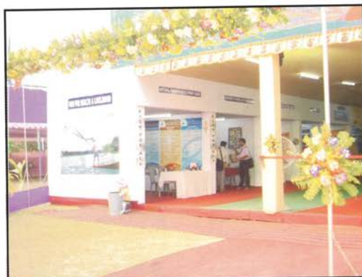
Eight Indian Fisheries Forum organised by Central Inland Fisheries Research Institute, Barrackpore from 22-26 th November, 08