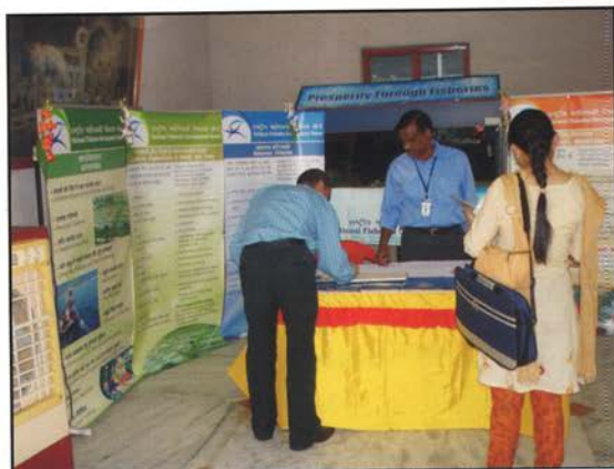
NFDB stall at National Conference on Aquatic Genetic Resource, NBGR, Lucknow April 26-27, 2008