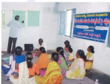
Training programme organised by KVK, Mahabobnagar (A. P.)