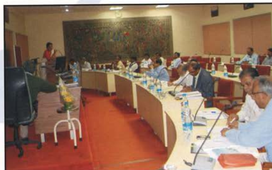
National Consultative Meeting with Directors of Fisheries Research and Development organisations at NAARM, Hyderabad, 23-24 th Dec., 2008