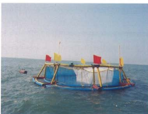
Cage with Shrimp at Mangalore