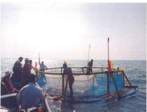
Mooring of cage at Mangalore