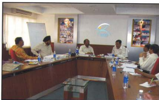
Western State Regional Meeting held at Hyderabad on 25.02.09