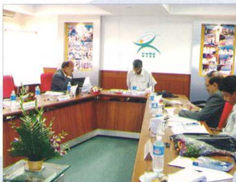
Twelfth Executive Committee Meeting of NFDB held at Hyderabad on 29 th December 2008