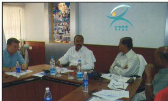
World Bank Team visited at NFDB on 07.12.2008 for a consultative meeting on Marine Fisheries

A Consultative Meeting was organized on 19-01-2009 at NFDB's Office, Hyderabad with the Seafood Processors/Exporters of Andhra Pradesh and Tamil Nadu to discuss about the utilization of the existing processing facilities, which are underutilized due to decrease in shrimp and fin fish production.