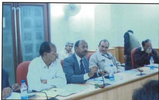
Northern States Regional Meeting, Delhi on 13.02.09