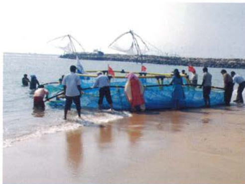
Launching of cage-Kochi