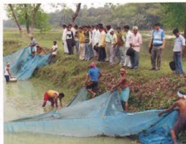
Field visit to Gazole fish farm by KVK, Malda (W.B.)