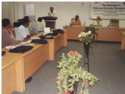
Training Programme on "New dimension in Fisheries Extension Management" for Junior Officers from 04-17.12.2008 at MANAGE, Hyderabad