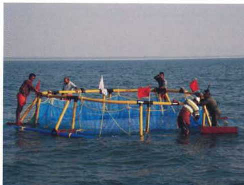
Mooring of cage- Kochi