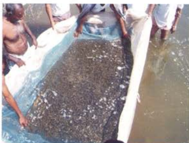
Seed stocking program at Andhra Pradesh