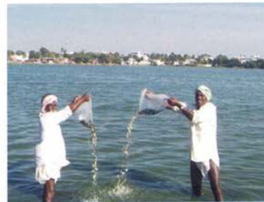
Seed stocking program at Andhra Pradesh