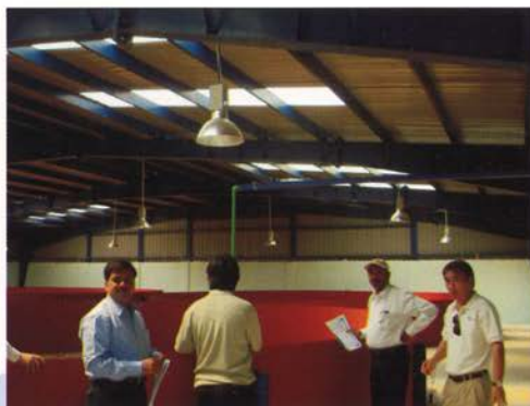
NFDB Delegation visited to M/s. Moana's SPF facility at Vietnam