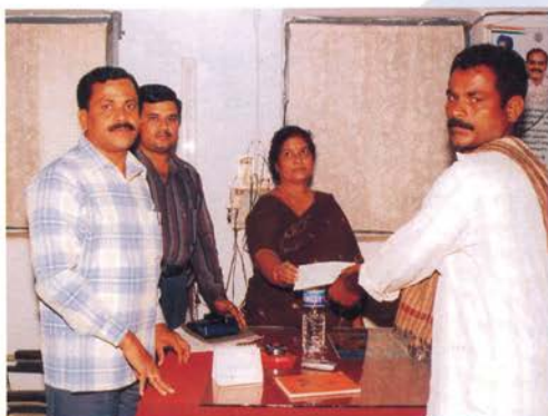
Land acquisition process at Sompeta, Srikakulam District, Andhra Pradesh for establishing the SPF Penaeus monodon Multiplication Centre

The works were entrusted to CPWD for execution. M/s. Moana HK Ltd has conveyed their formal concurrence for the detailed estimates given by the CPWD on site development works and seawater intake system. In this regard, CPWD furnished the Preliminary Estimate amounting to Rs. 51, 02, 00,000/- for all the components of the MC project. The above estimate was sent to M/s. Moana HK Ltd for information and comments.