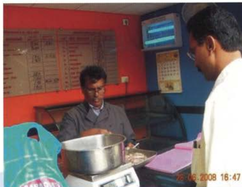
Neidhal TNFDC Fish Retail Outlet