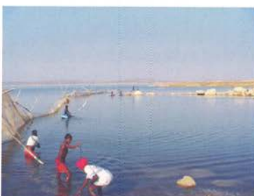
Penculture at Essapur dam, Maharashtra