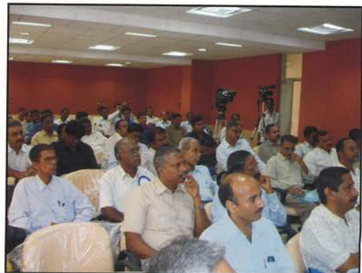
Brain Storming Workshop on "Prospects of Asian Seabass Farming" at CIBA, Chennai on 29 th August 2008