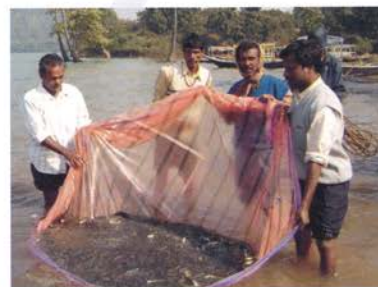
Stocking of fish fingerlings in Reservoirs Jharkhand